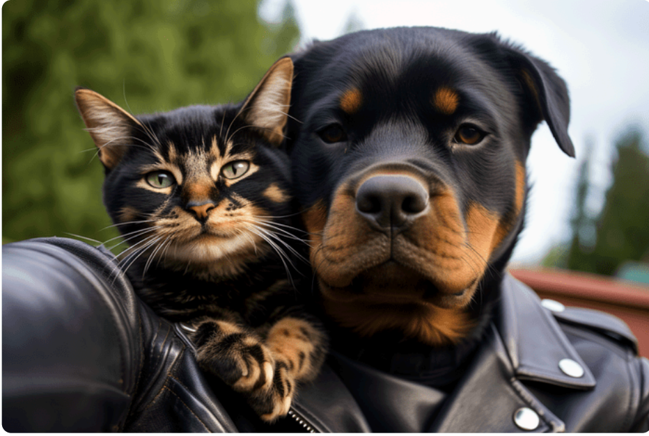
AI GENERATED IMAGE (2023)/MIDJOURNEY