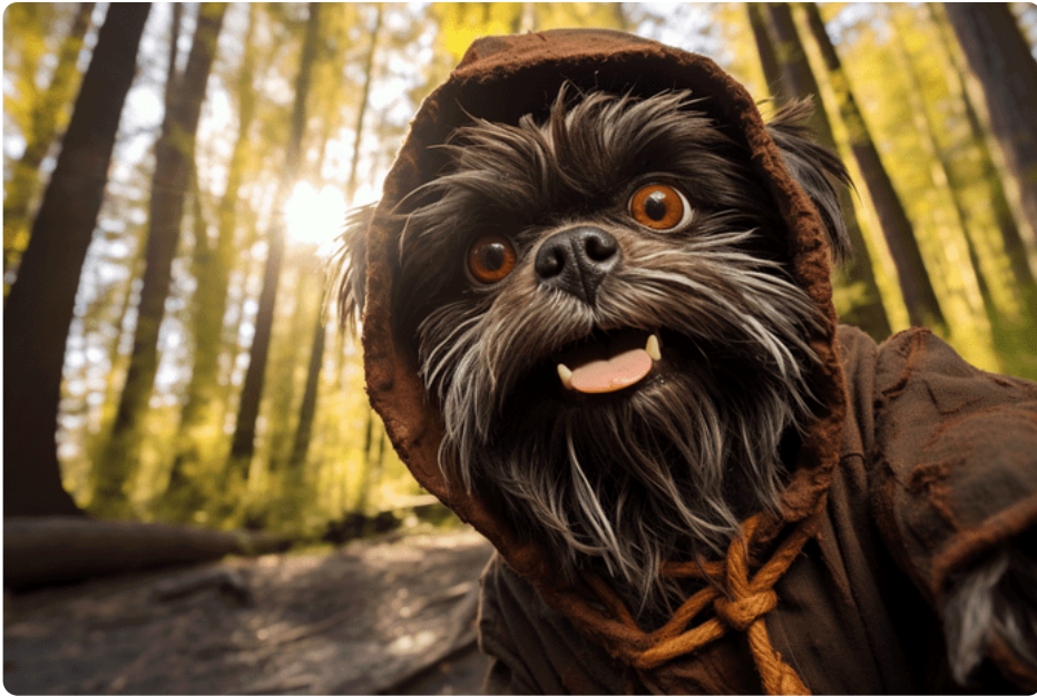
AI GENERATED IMAGE (2023)/MIDJOURNEY