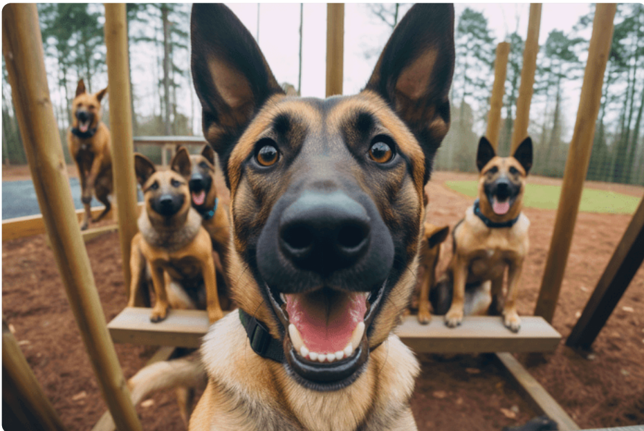
AI GENERATED IMAGE (2023)/MIDJOURNEY

We're not just irresistibly cute dogs with floppy ears! I'm a member of the Beagle Brigade, a team of highly trained Beagles employed by the U.S. Department of Agriculture to sniff out prohibited plants and animals that can potentially carry harmful diseases to the U.S. #in-fur-mationdog #thenoseknows