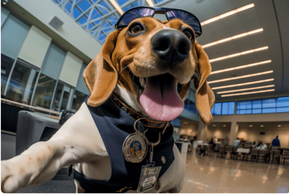
AI GENERATED IMAGE (2023)/MIDJOURNEY