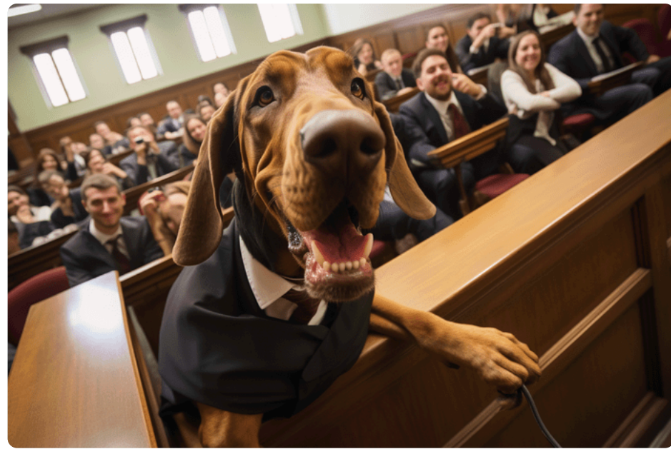
AI GENERATED IMAGE (2023)/MIDJOURNEY

I'm a Belgian Malinois—strong, loyal and wicked smart. Plus, I just happen to be one of the best guard dogs around to protect your family. #classvibes #bootcampbuddies