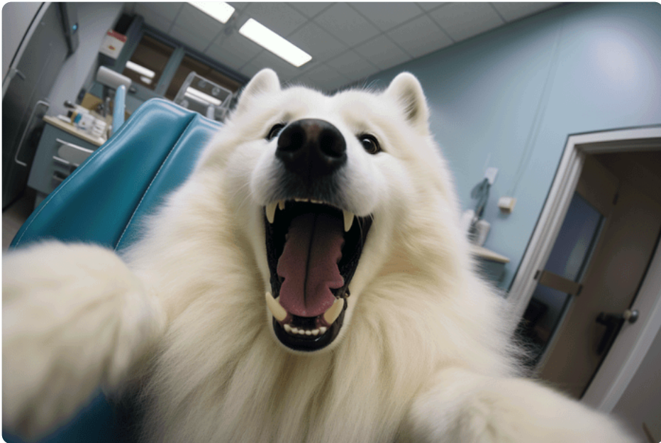
AI GENERATED IMAGE (2023)/MIDJOURNEY

What can I say? Huskies are driven by wanderlust, and we love to howl and party together. So you'd better keep an eye on us or we're all gonna Houdini-it out of our backyards and meet up when you're not looking! #escapeartist #packlife