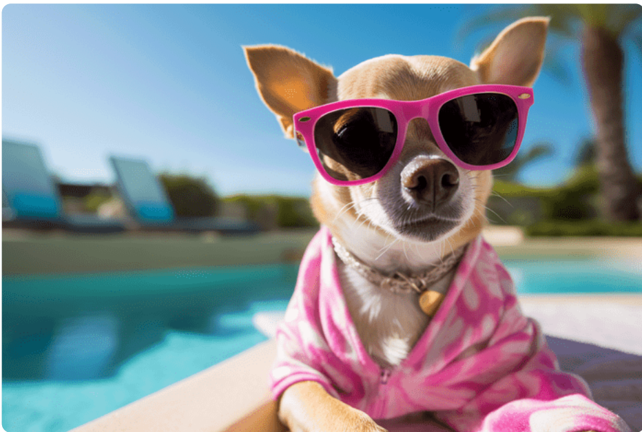
AI GENERATED IMAGE (2023)/MIDJOURNEY

How 'bout a round of appaws ? As a Boston terrier, I'm the most sophisticated and distinguished of all the black-and-white dog breeds , after all. Just being honest! #glamgoals #blacktie