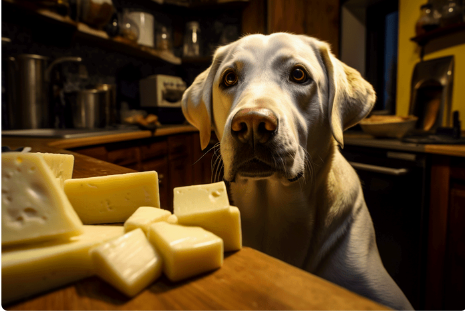
AI GENERATED IMAGE (2023)/MIDJOURNEY