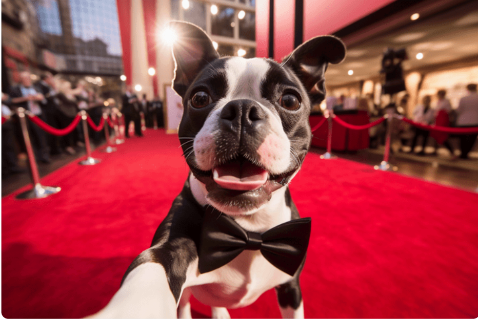
AI GENERATED IMAGE (2023)/MIDJOURNEY