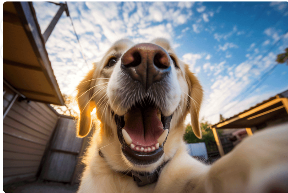
AI GENERATED IMAGE (2023)/MIDJOURNEY