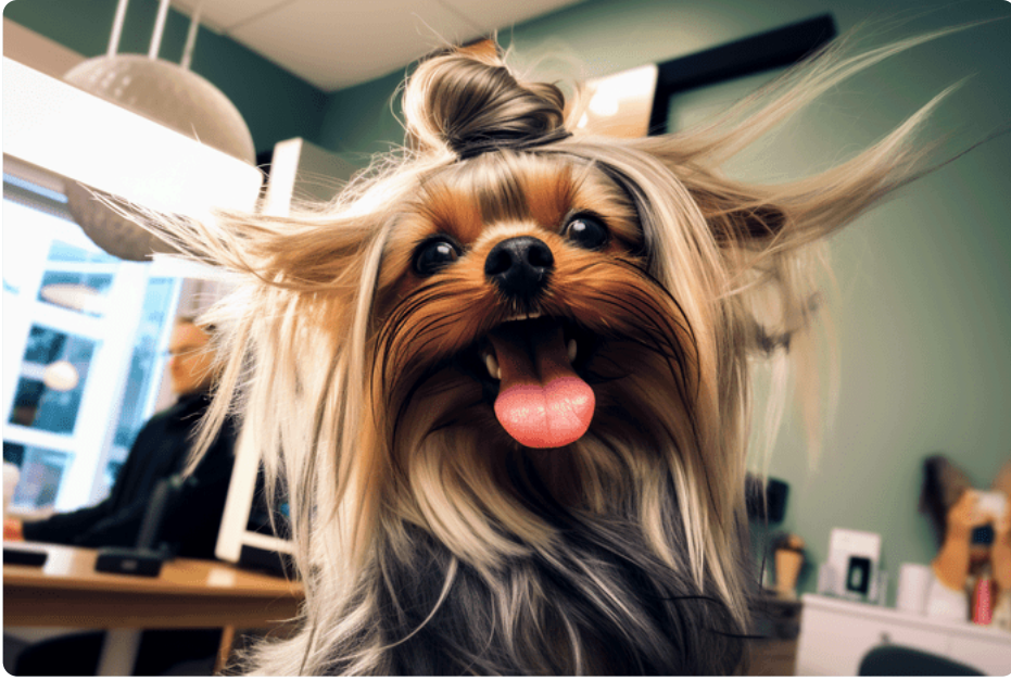
AI GENERATED IMAGE (2023)/MIDJOURNEY