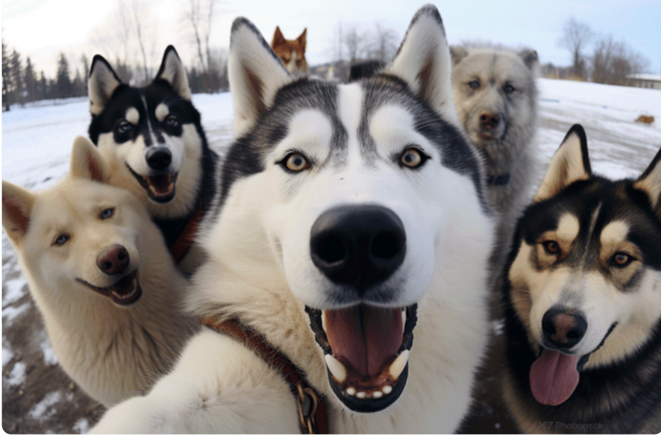
AI GENERATED IMAGE (2023)/MIDJOURNEY