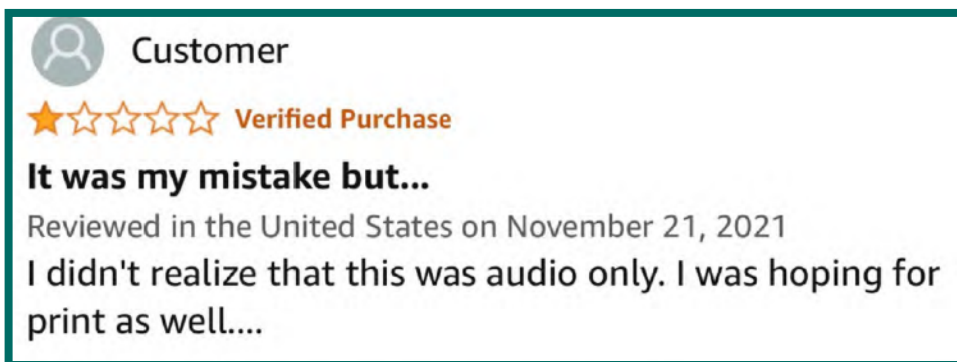
Image Description: Screenshot of a one-star Amazon review for an AUDIO book.

Review is titled "Do I own this" and the review says "I don't know what this is ... Something I would probably like but I do not have it [in my] possession."