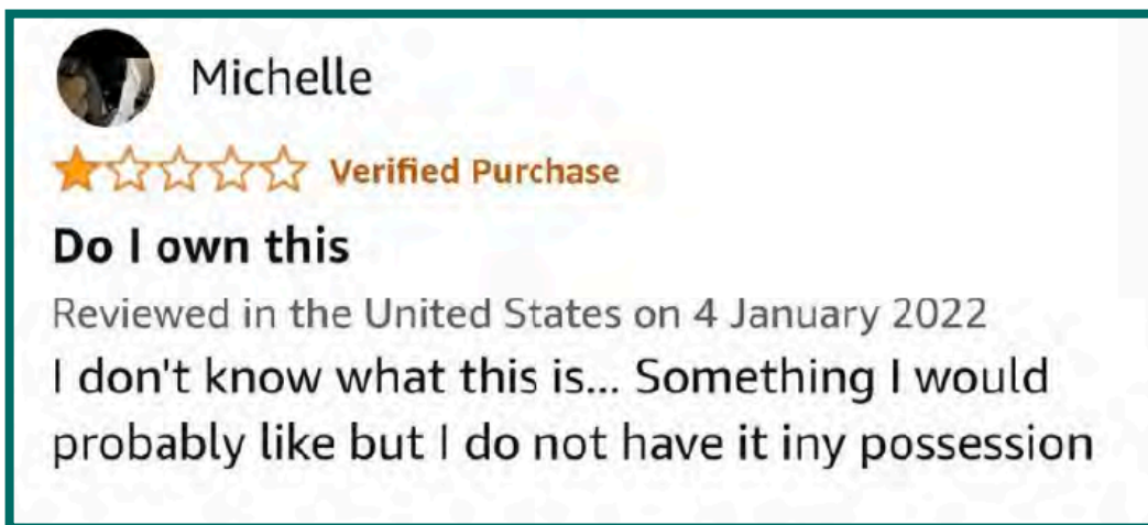
Image Description: Screenshot of a one-star Amazon review for a book.

Review is titled "Do I own this" and the review says "I don't know what this is ... Something I would probably like but I do not have it [in my] possession."