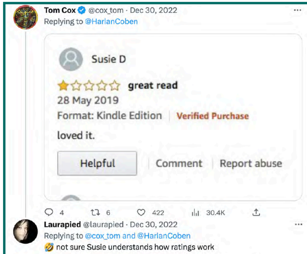
Image Description: Screenshot of a one-star Amazon review for a book.

Review is titled "no time to read books," and the review says "I did not read this, don't have time to read books."