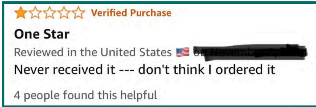
Image Description: Screenshot of a one-star Amazon review for a book.

[NOTE: A one-star rating is the lowest rating on Amazon reviews.]