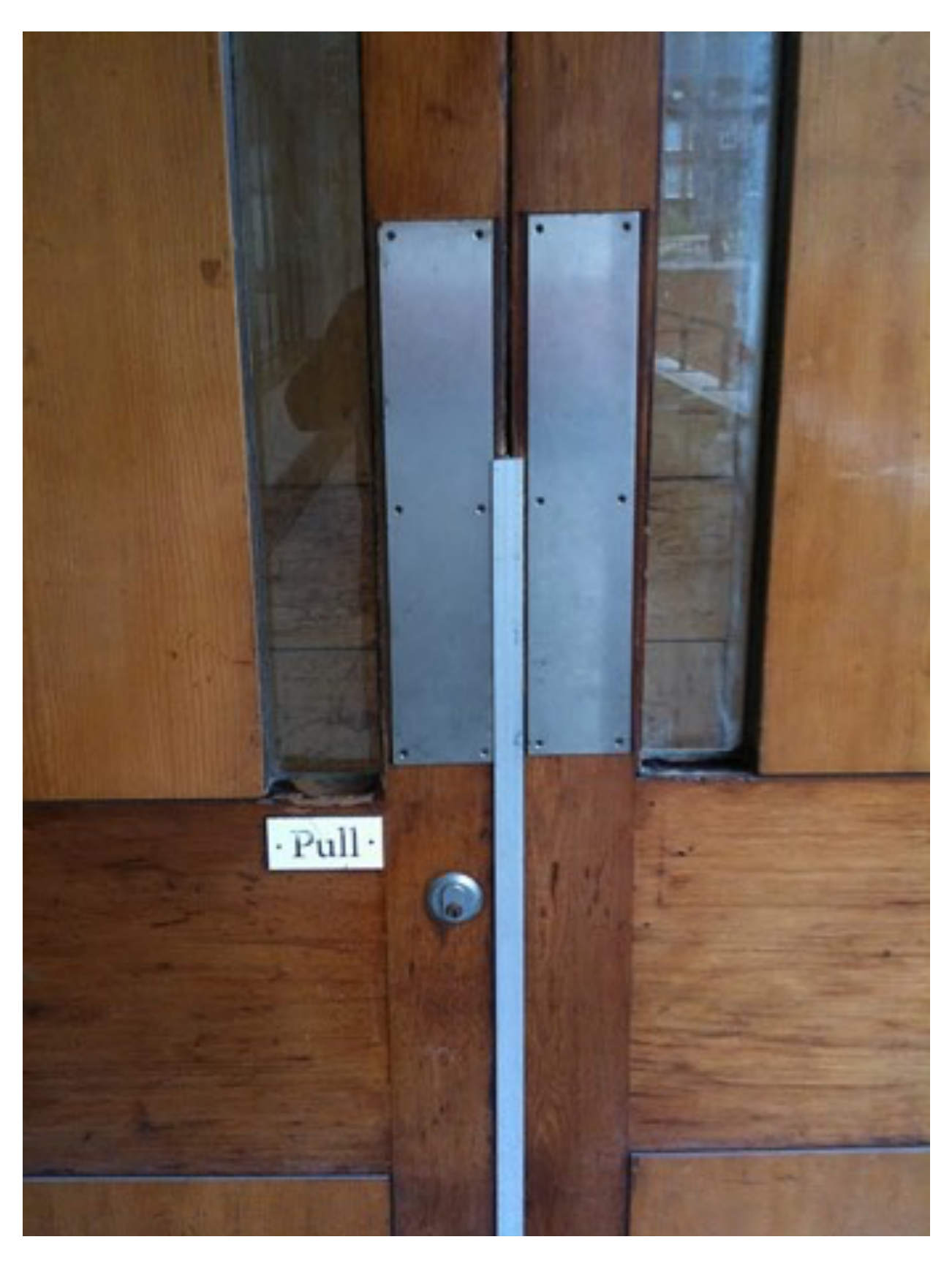
Image Description: Photo of a double doorway entrance. Each brown wooden door has a flat metal plate that suggests a user should push the flat metal plate to open the door.

However, there is a sign on the door that says "Pull," suggesting rather than using the flat metal plates to push open the door, users should use the flat metal plates to pull open the door.