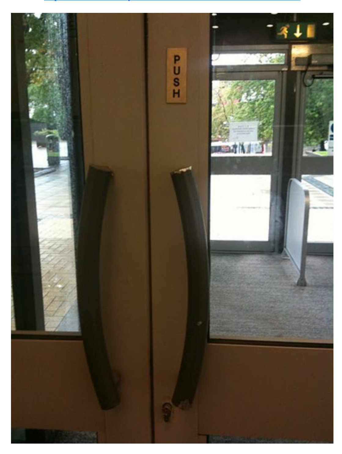
Image Description: Photo of a double doorway entrance. Each brown wooden door has a curved handle that suggests a user should pull the handle to open the door.

https://twitter.com/PsychScientists/status/1400085794631659522